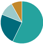
Allocation of underlying funds*