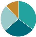
Allocation of underlying funds*